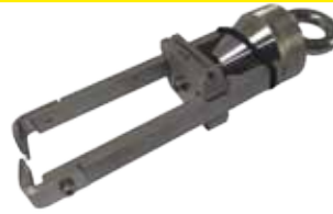
Article n°: LE1286