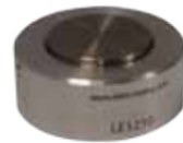
Article n°: LE1210