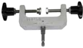
Article n°: LE1297