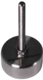
Article n°: LE1417