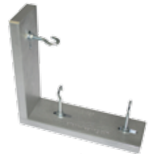
Article n° LE1637