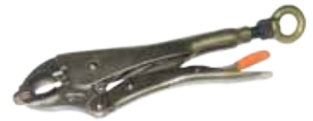
Article n°: LE1270