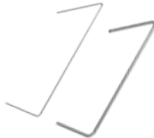
Article n° LE1635 : 1/16 in.