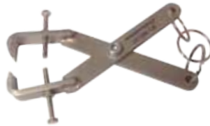
Article n°: LE1200