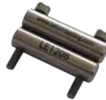
Article n°: LE1208