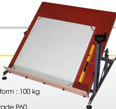
Article n°: LE2050